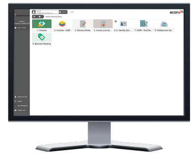
Scan2x on Windows