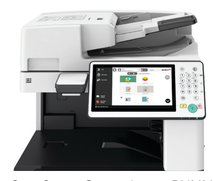
Scan2x on Canon imageRUNNER