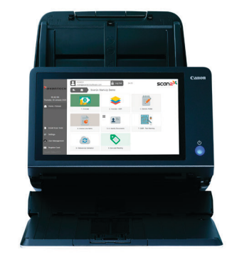
Scan2x on Canon ScanFront